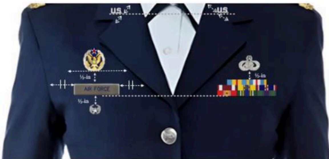
Single Duty Badge Configuration