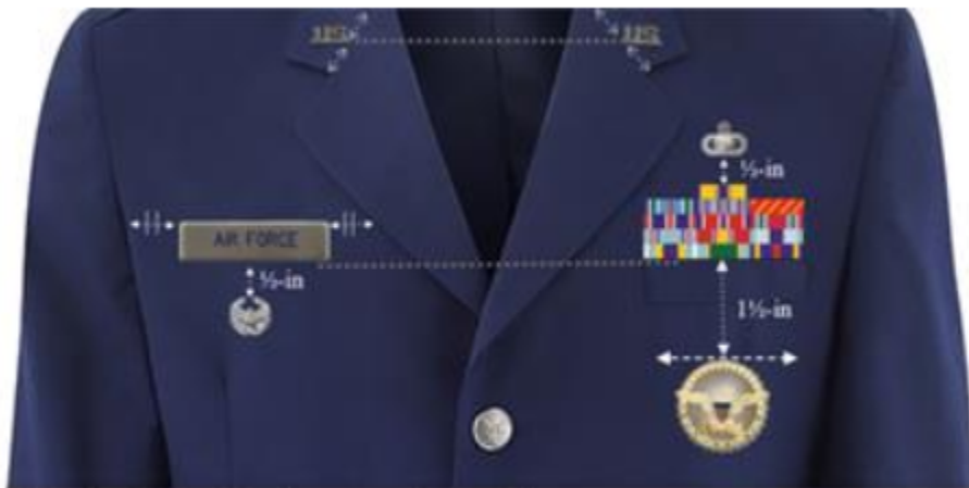
Single Duty Badge Configuration