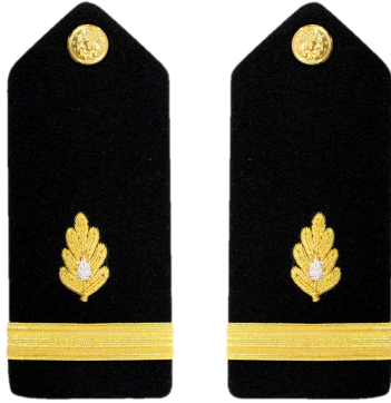
Navy Medical Corps Ensign (O-1)